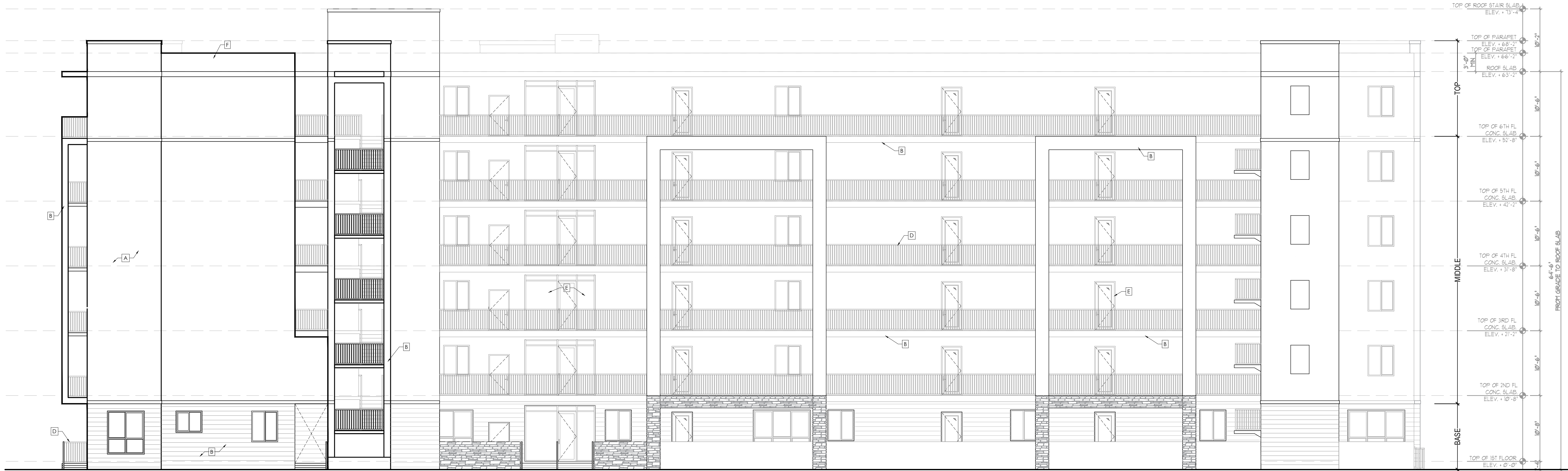
TYPE 52 UNIT BUILDING - REAR ELEVATION

Received after DRC Meeting to address DRC comments prior to the submission of a Building Permit Application.